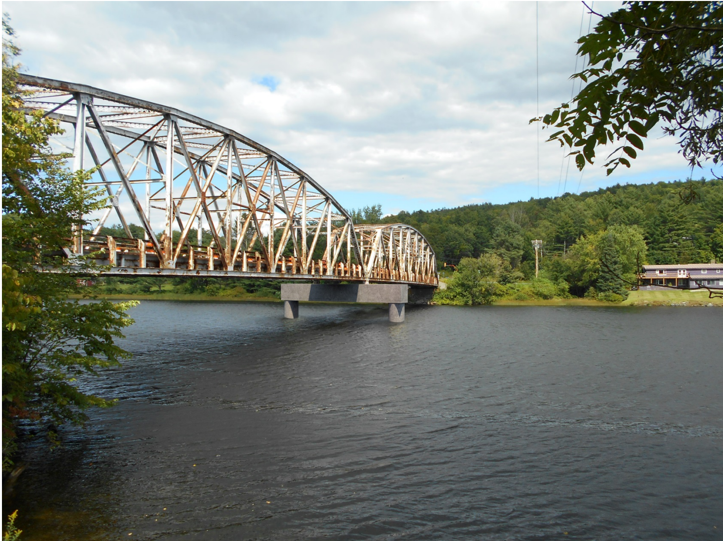
Pier Replacement Option 2