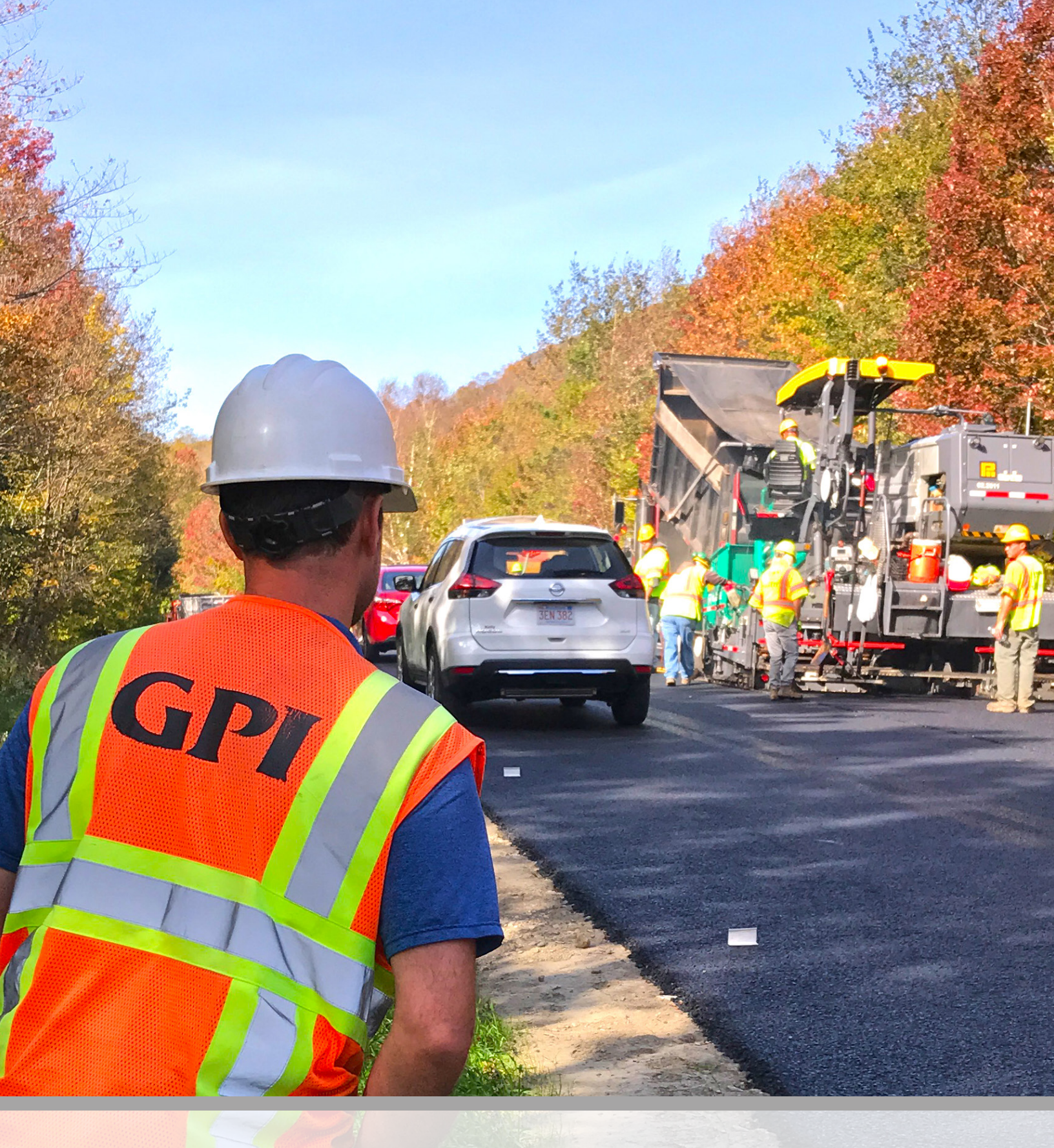
Section 2 Project Understanding & Approach