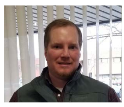
PROJECT ASSIGNMENT Environmental Inspector