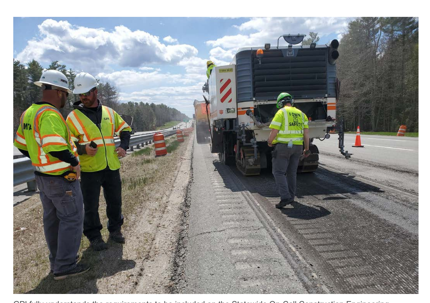
GPI fully understands the requirements to be included on the Statewide On-Call Construction Engineering and Inspection Services Prequalified List, as we are currently successfully providing these services to NHDOT and municipalities. Through our experience, GPI has proven an ability to respond rapidly to requests and provide qualified construction inspectors for all aspects of highway and bridge construction, assuring contractor compliance with the plans, specifications, and environmental commitments. The GPI New England offices are poised to continue providing these services to NHDOT locally and in a timely fashion.