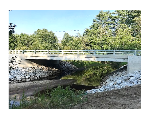
Two bridges on Stage Road in Gilmanton were bundled, creating design and construction efficiencies.

Hoyle Tanner's depth of experience in the Municipally-Managed State Bridge Aid program includes 122 projects – more than any other firm. Several of these projects were also funded through the Municipal Off-System Bridge Rehabilitation and Replacement (MOBRR) program which met full federal LPA requirements. In the past two years, our bridge design projects have included precast rigid frames, prestressed deck beams, single and multi-span steel stringer, pedestrian and historic covered bridges. In addition, our team includes five NBIS bridge certified inspectors who routinely perform inspections and load ratings including steel truss gusset plates for municipal contracts as well as NHDOT, MaineDOT, VTrans and MassDOT.