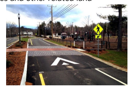
Innovative design features were utilized in the Union Street reconstruction in Peterborough to improve the livability and walkability of the area.

Hoyle Tanner is particularly knowledgeable on the current practices and implementation of the "Manual on Uniform Traffic Control Devices" (MUTCD), the highway safety manual and others to increase safety for pedestrians, and bicycles crossing or sharing the roadway with vehicles. In addition, our understanding of new publications, such as the "Small Town and Rural Multimodal Networks" guide from FHWA, will offer municipalities options for context sensitive highway solutions.