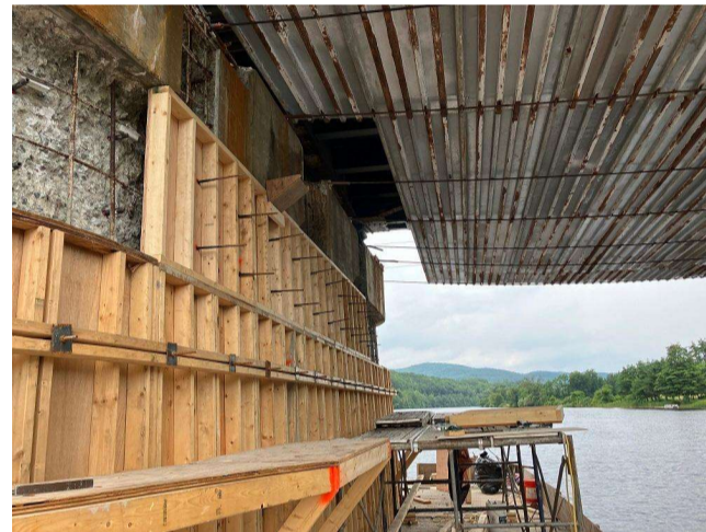
NH side of the pier, removal of inferior concrete completed with formwork mostly in place for new concrete