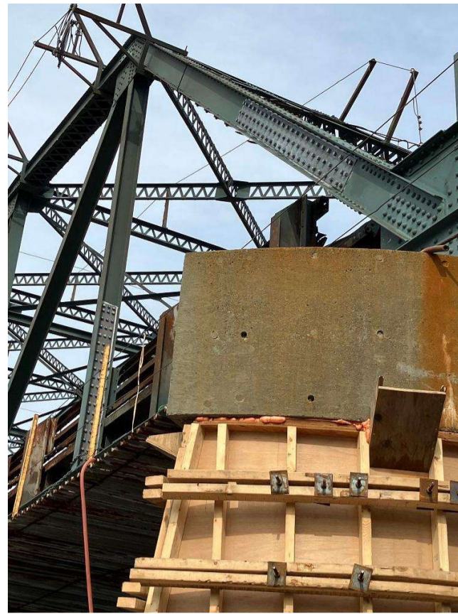
Downstream nosing formwork in place, ready for new concrete