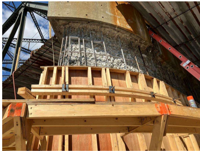
Downstream end of the pier showing the upper portion of repairs to the concrete before forms were completed