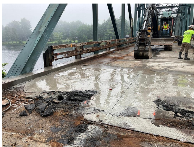
Beginning of saw cutting and deck removal