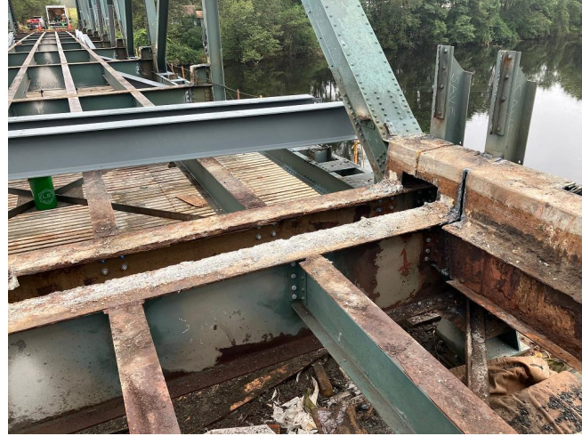
Removal of deck pieces after saw cutting