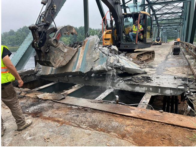
Deck removal activities to the pier