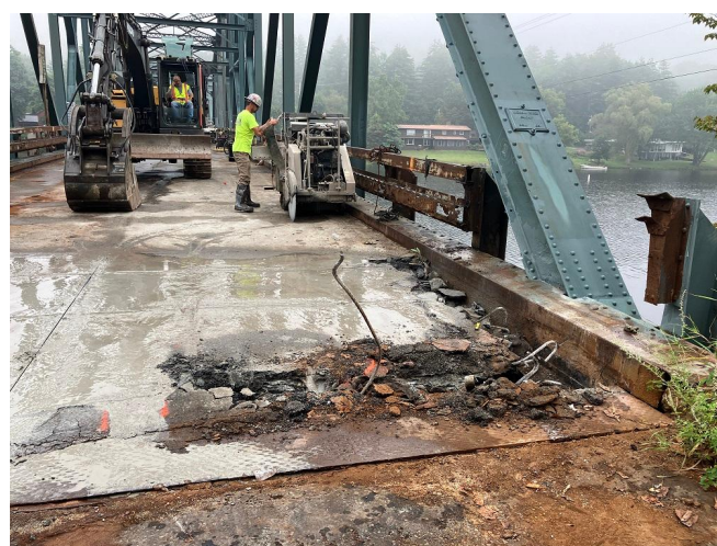
Deck removal at the west end of the bridge