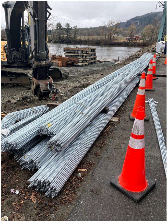
Galvanized reinforcing steel