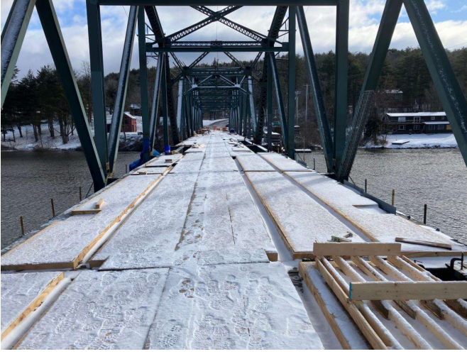
Winter weather on the bridge