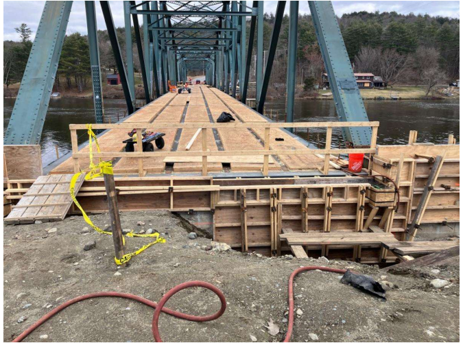
View from Vermont side