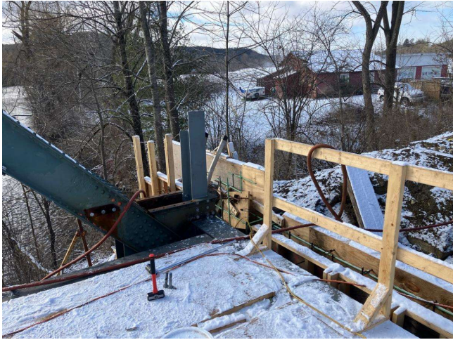
Repairs work in progress