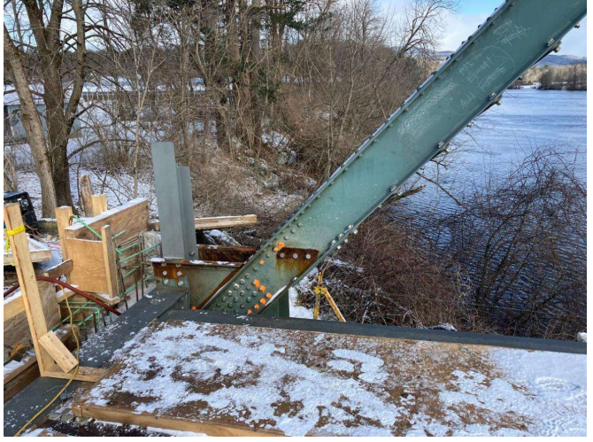
Guardrail post repaired