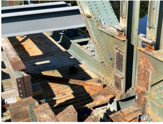
Structural steel repair