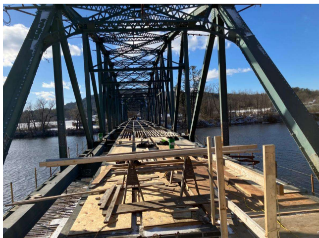
Deck formwork progress