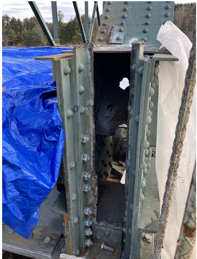
End post repair