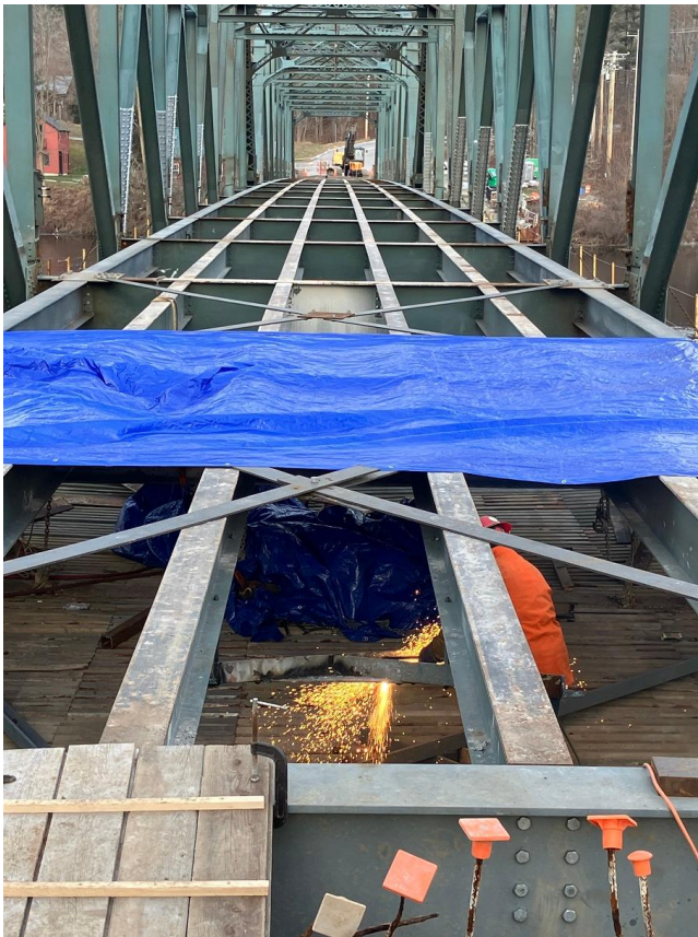
Cross bracing repair