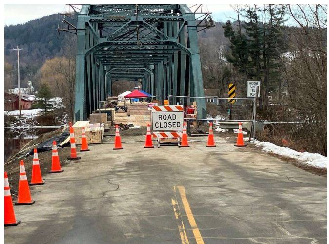
Bridge closure sign