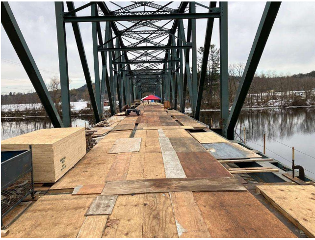
Deck formwork progress