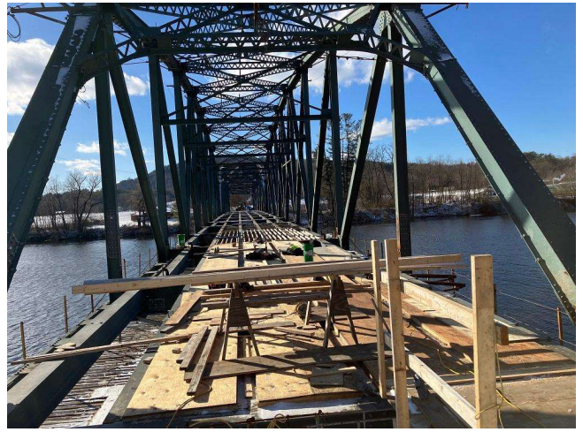
Deck forms going into place