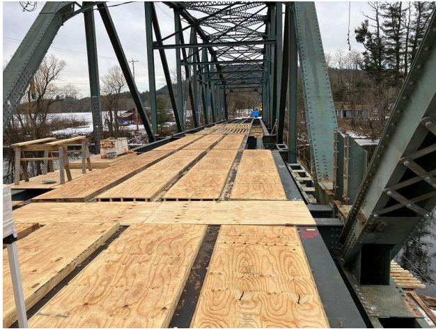
Span one deck forms