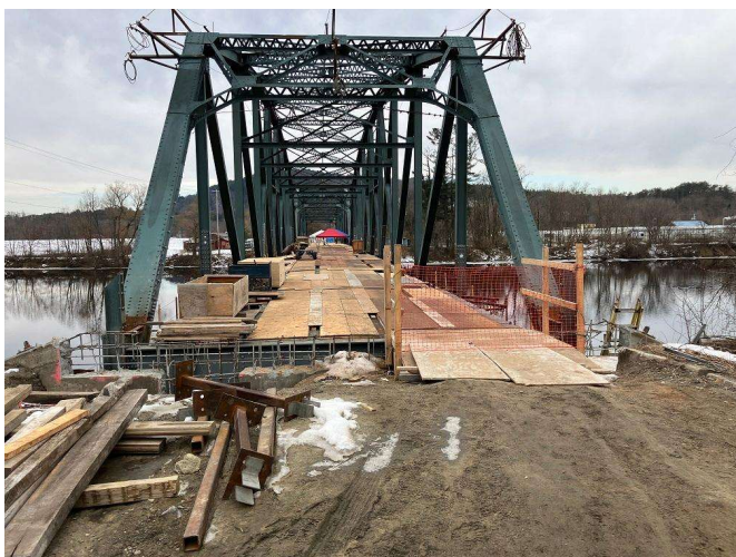
View of the bridge work in progress