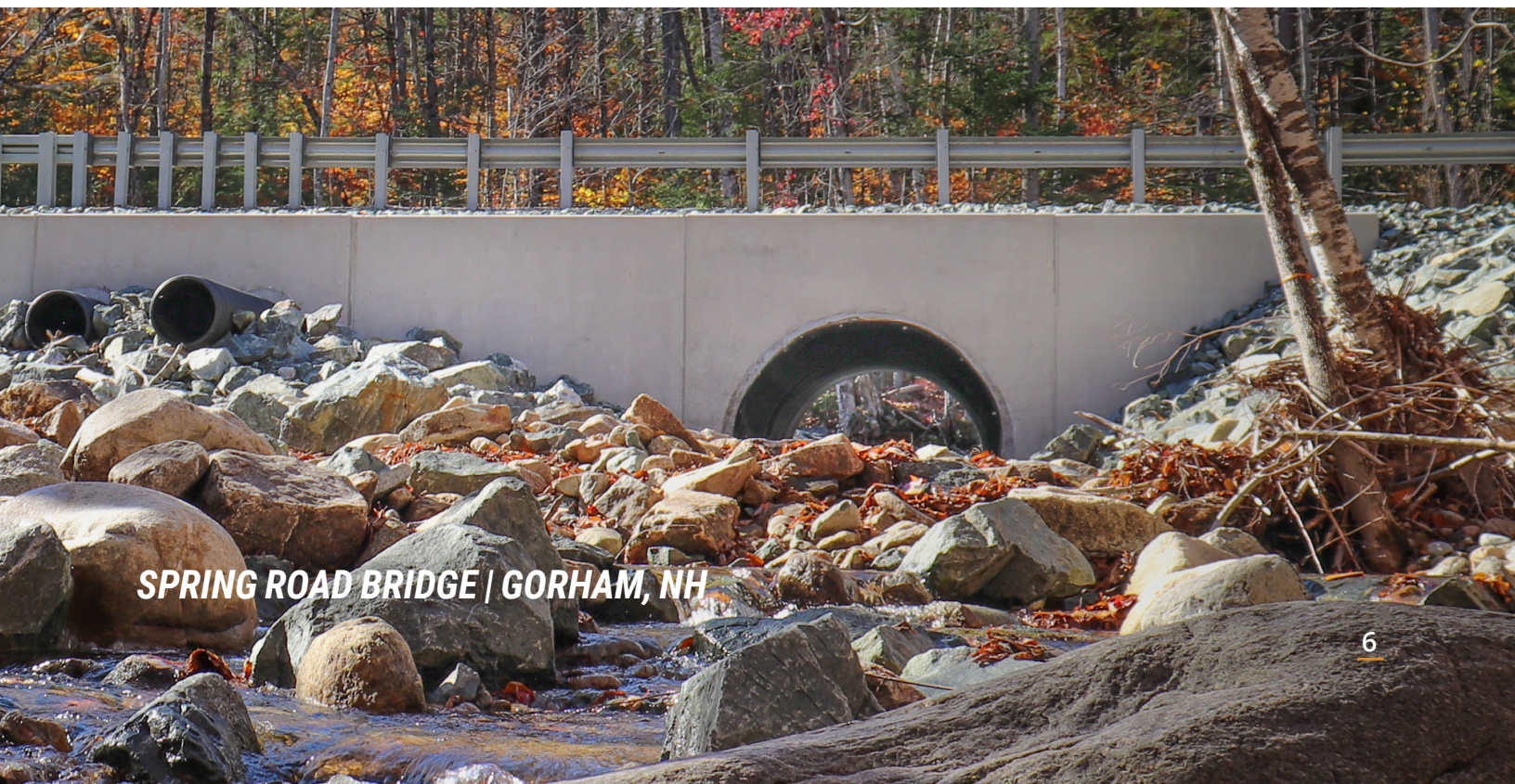
SPRING ROAD BRIDGE | GORHAM, NH

Founded in 1983, Preservation Company is New Hampshire's oldest and largest preservation firm. We offer a range of preservation services to public and private clients, with a concentration in the New England region. We are listed as a certified woman-owned DBE in Maine, Massachusetts, New Hampshire and Vermont. Preservation Company has partnered with architectural and engineering firms, government agencies, non-profits and private owners on hundreds of successful projects throughout New England.