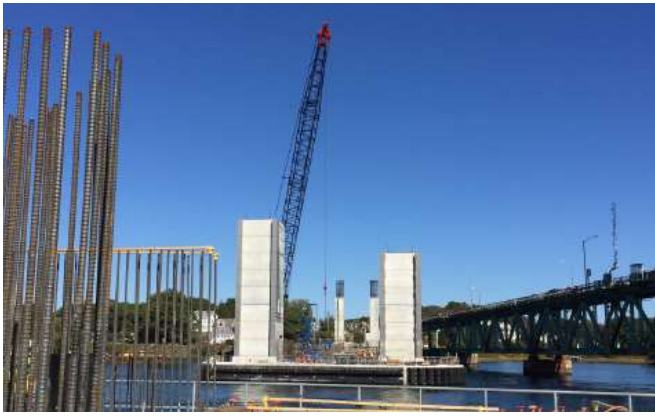
A view of the SML Bridge towers under construction.