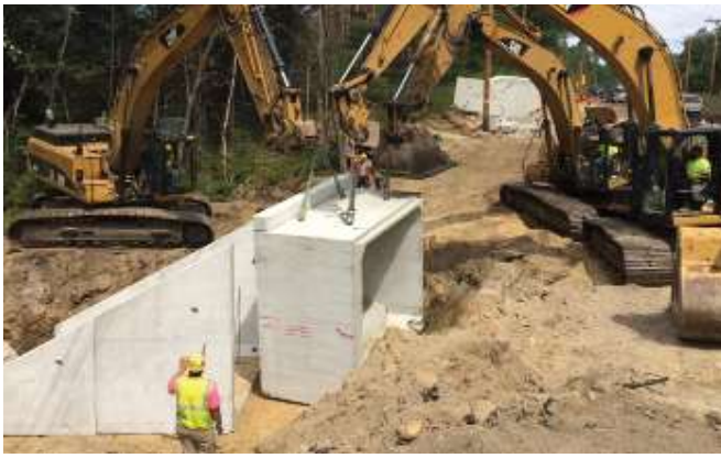
A precast box culvert is lowered into place on Route 302.