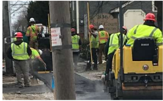
The Washington Avenue Improvements project paves sidewalks.

Kleinfelder staff provided detailed inspection and documentation with the goal of proactively mitigating any potential issues to maintain schedule and prevent delays on this complex project.