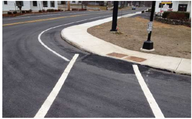
East Main Street Highway Improvements project nearing completion.

We also provided shop fabrication oversight of the eight-foot deep, high-strength, weathering steel girders. We provided materials testing for both soils, concrete, and asphalt in accordance with quality assurance program for municipally managed NHDOT projects.