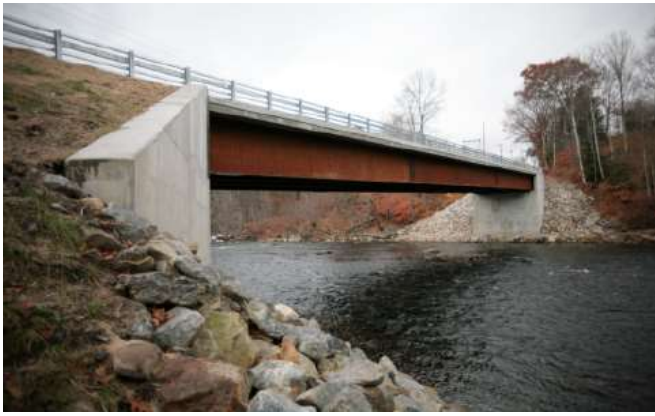
The Central Street Bridge at completion.