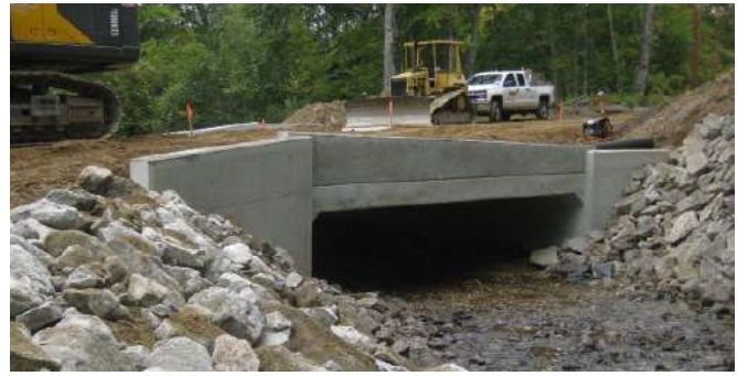
The Echo Valley Farm Road Bridge is shown during construction.

This bridge aid project was federally funded and therefore required near full-time construction observation and increased construction administration efforts by the Kleinfelder team to monitor federal labor compliance in close coordination with NHDOT's OFC. We also provided materials testing and shop fabrication oversight during the construction phases services as part of the quality assurance/quality control program.