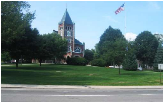
A section of the project area at UNH.