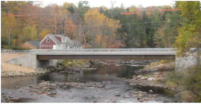
The Oak Street Bridge shortly after it opened to traffic.