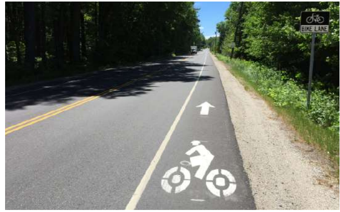
Constructing the new sewer line in Manchester.

The beautified Main Street streetscape enhances user safety and travel efficiency and promotes non-vehicular traffic, creating a positive environmental impact on the community. The project was substantially complete in time for the start of UNH's academic year and stayed within the construction budget.