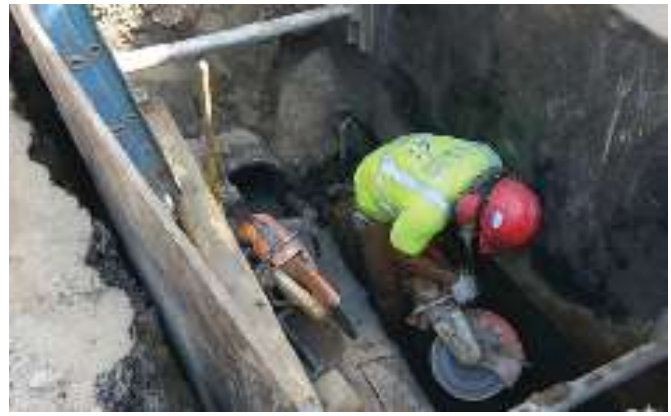
Water main upgrades in Somerville.

Our inspectors utilized auto level, GPS, pop-level, and grade stakes and strings to properly inspect the roadway, box cuts and gravel fill placements. Finally, our inspectors also assisted MaineDOT with implementing full electronic documentation and record keeping.