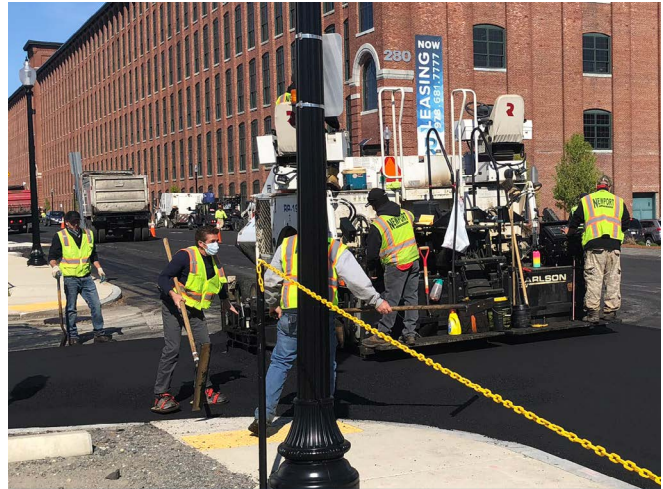
TEC will verify that work is performed in accordance with the approved plans and that resources and infrastructure is protected.

TEC will be responsible for scheduling, documenting, and leading a successful preconstruction meeting , held prior to the start of the project to establish the schedule and key contacts. We will discuss special requirements such as specific details in the contract documents, utility coordination, material testing, the quality assurance program, and communication with stakeholders, local officials, and emergency responders.